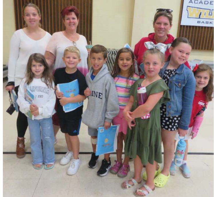
Families at weekend Masses September 16 and 17